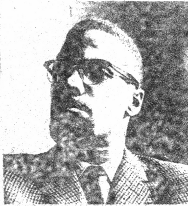
AL HADJ MALIK SHABAZZ