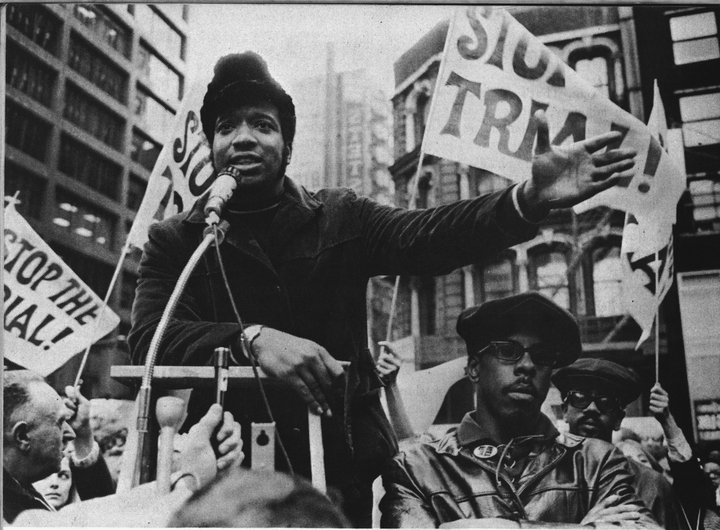
FRED HAMPTON, 1948-1969