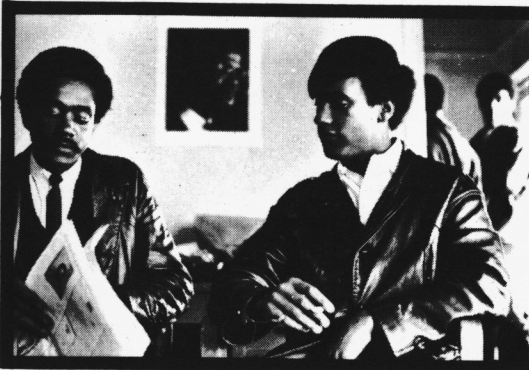
July 1967--Minister of Defense, Huey P. Newton (right) and Chairman, Bobby Seale (left), reading an early edition of B.P.P. Newspaper at the home of Eldridge Cleaver, Minister of Information B.P.P.

BLACK COMMUNITY NEWS SERVICE PUBLISHED WEEKLY BY THE BLACK PANTHER PARTY